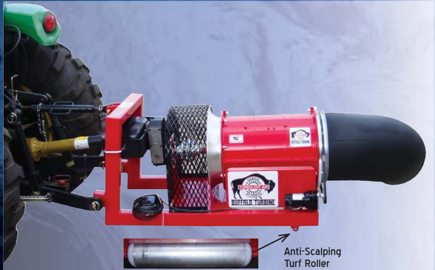
Buffalo Turbine Part # BT-CPTO / 20 HP @ PTO

Support stand Waterproof cover Rectangular nozzles (10" & 19" long)